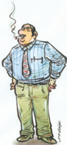
Smoking : the second major risk factor

Daily intake of bakery products/snacks was nearly seven times higher in controls compared to the intake by patients. However CAD patients, before diagnosis, were habitually consuming large quantity of starchy and fatty foods with plenty of deep fried fish, chicken, mutton and beef along with bakery products/snacks with no restriction at all. However the intake of vegetables